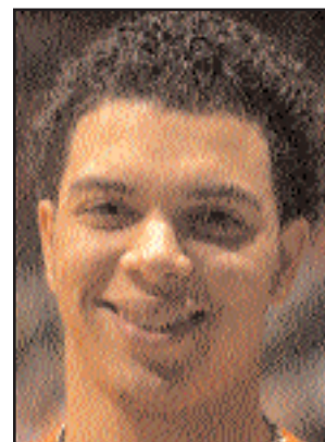
▲ Deron Williams